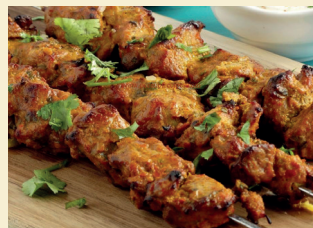
LAMB COMBO (4 SKEWERS & DONER KEBAB) £9.95 Lamb tikka, lamb doner and lamb kebab served with salad, naan and sauce.