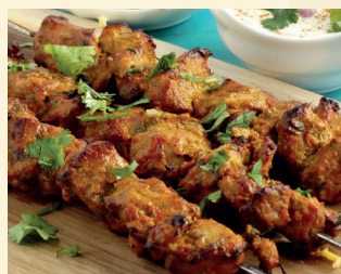
LAMB TIKKA (2 SKEWERS) £6.95 Pieces of marinated lamb tikka, salad and naan with sauce.