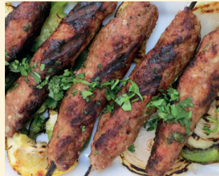
LAMB SHEIKH KEBAB (2 SKEWERS) £6.95 Marinated lamb kebab served with salad, naan and sauce.