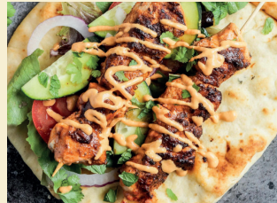
INDULGED CHICKEN (MAIN) £7.95 Chicken tikka covered in slightly hot sauce with naan.