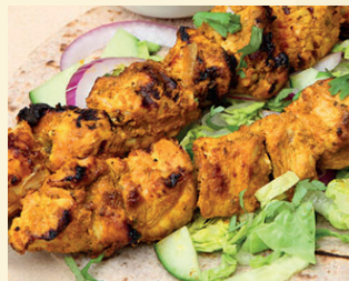
CHICKEN TIKKA (2 SKEWERS) £6.95 Marinated chicken tikka served with salad, naan and sauce.